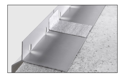
Figure 1: Waterproofing of abutting seams with Schlüter®-BARA-HV

The profiles require no special maintenance or care. The powder coated surface of the aluminium profile is colourfast. Damaged visible surfaces can be restored with paint.