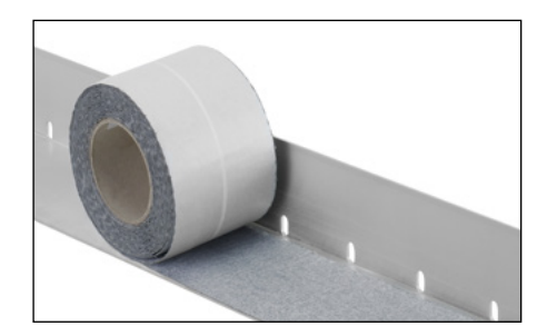
Figure 2: Embedding Schlüter®-BARA-HV