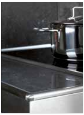
The finishing profiles Schlüter®-JOLLY (left) and Schlüter®-RONDEC (right) add beautiful finishing touches to tiled areas.