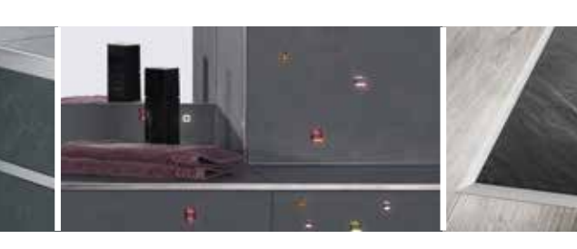
Edge protection and design options for tiled walls