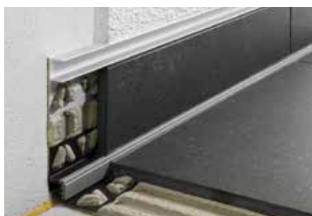
Installation in skirting