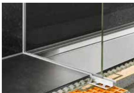
Installation in shower with glass element