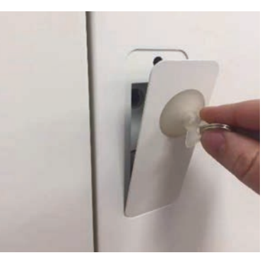
Cover being pulled