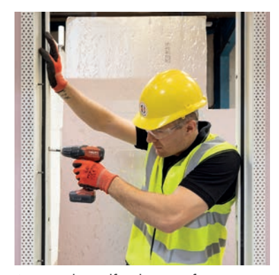
Secure the self-adjusting frame to the stud work through the side fixings using suitable substrate screws.