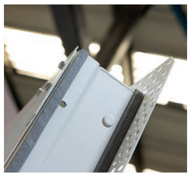
Factory applied intumescent strips eliminate the need for intumescent mastic application.