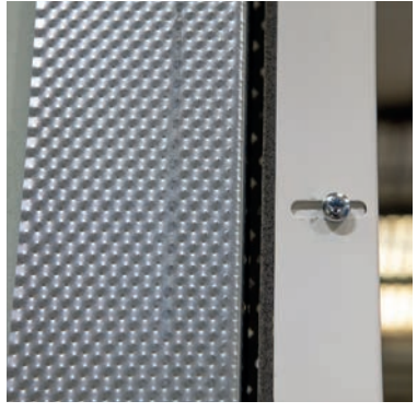
Ensure the foam gasket has been compressed by the frame channel to ensure a good seal with the substructure.