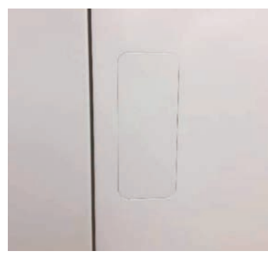
Cover installed flush

Lock cover, this is a rectangular cover which has a locating tap at the bottom and a small magnet at the top, using a suction cup pull the top of the cover and remove.