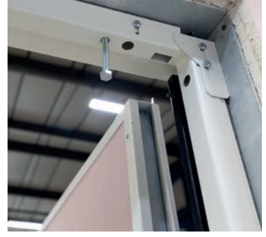
Insert the jacking screws top and bottom if they are not already fitted into the frame.