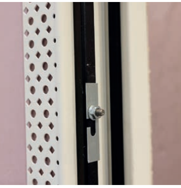
Add shims to allow gap adjustment if required.