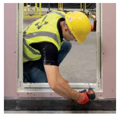
Secure the frame on all sides through all fixing points of the frame.