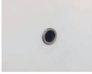
Hole within panel

This lock is a simple T-Bar key lock. To operate insert a T-Bar key into the face of the panel and turn clockwise or anti-clock wise to lock/unlock the panel.