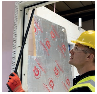
Position the spacer along the hinged side of the frame and door assembly.