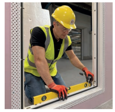
Adjust the position of the frame using the jacking screws to ensure it is aligned vertically and horizontally within the structural opening.