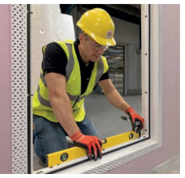
Adjust the position of the frame using the jacking screws to ensure it is aligned vertically and horizontally within the structural opening.