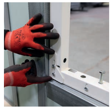
Lock the real bolts on the back of the frame ensuring the plates are pushed tight against the sub frame.

Remove all of the jacking screws from the frame