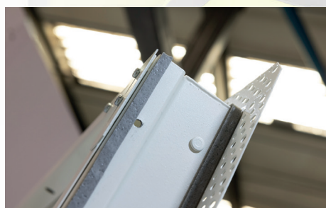
Factory applied intumescent strips removes the need for mastic application