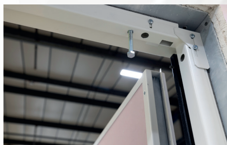
PRECISION Adjustable Frame dramatically reduces fitting times