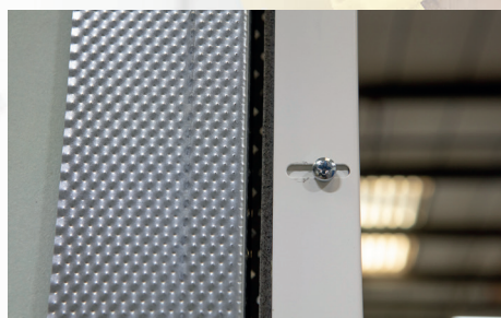
Frame adjusts to fit each structural opening, no plastic packers required