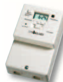
ETU2000 / ETU8000

Look out for our wide range of energy saving products saving you money, energy and helping the environment by reducing your carbon footprint.