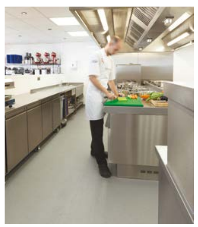
Rosemary Shrager's Cookery School

We have full confidence in the long-term performance of our products, and we back this up with generous, industry leading warranties. Wall cladding installations undertaken by Altro Premier Installers are also warrantied.